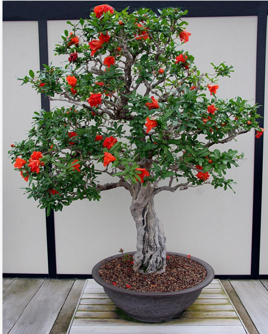
Pomegranate ( Punica granatum )