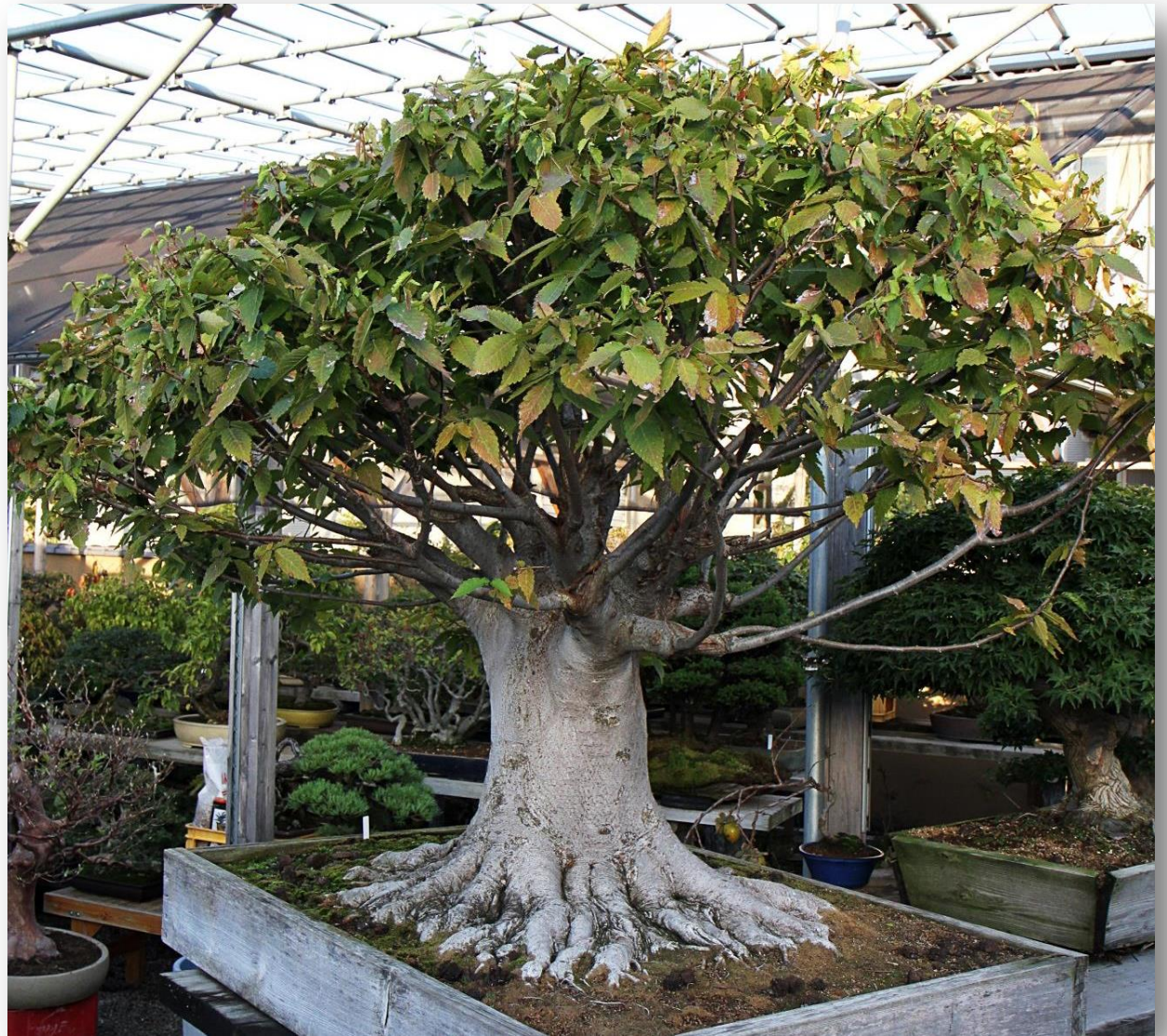
Japanese zelkova ( Zelkova serrata )