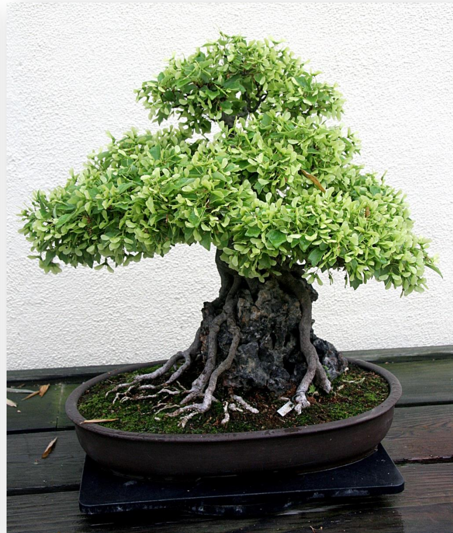
Trident maple ( Acer buergerianum )