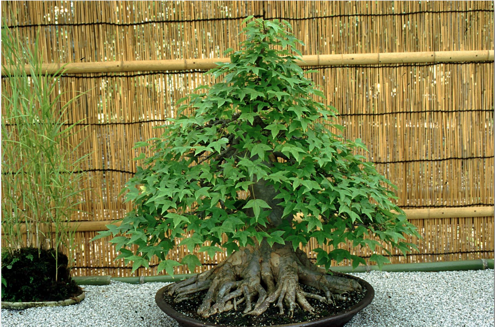
Trident maple ( Acer buergerianum )