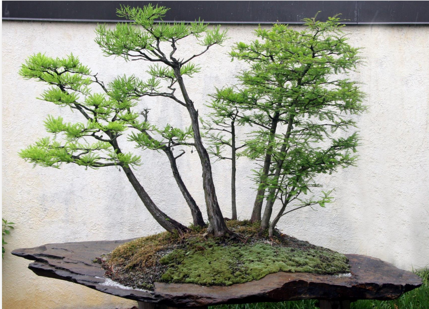
Bald cypress ( Taxodium distichum )