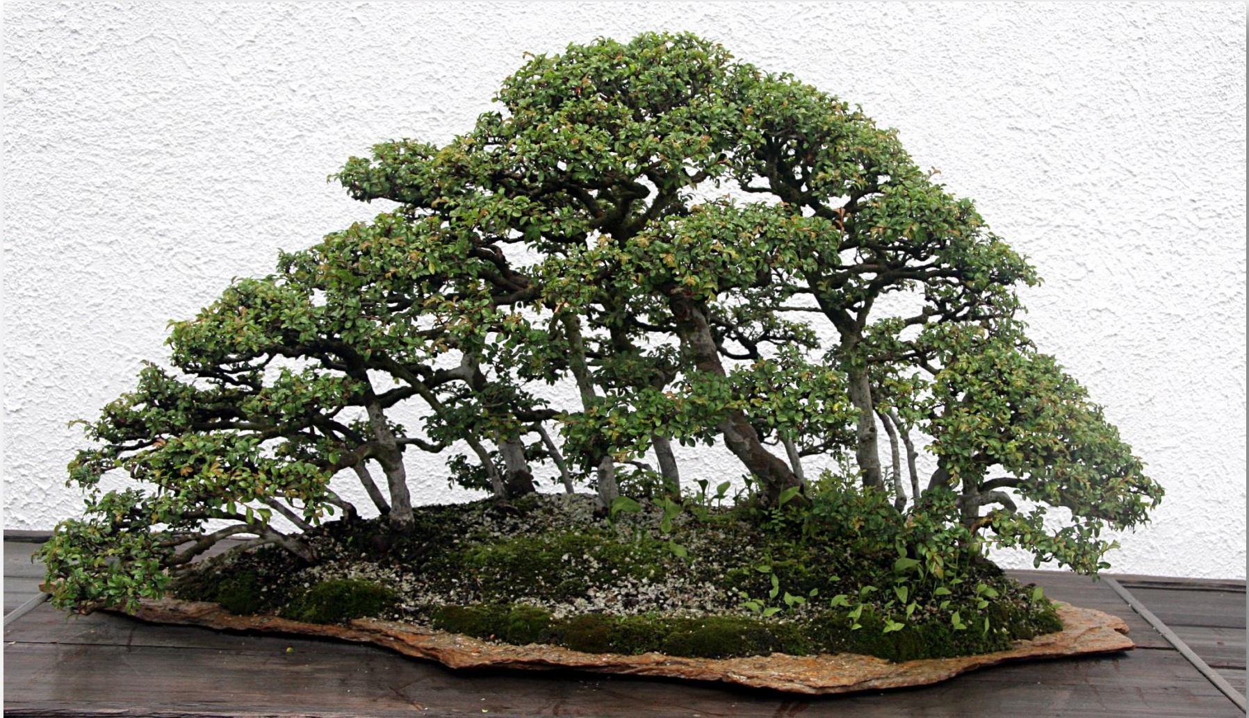
Chinese elm ( Ulmus parviflora )