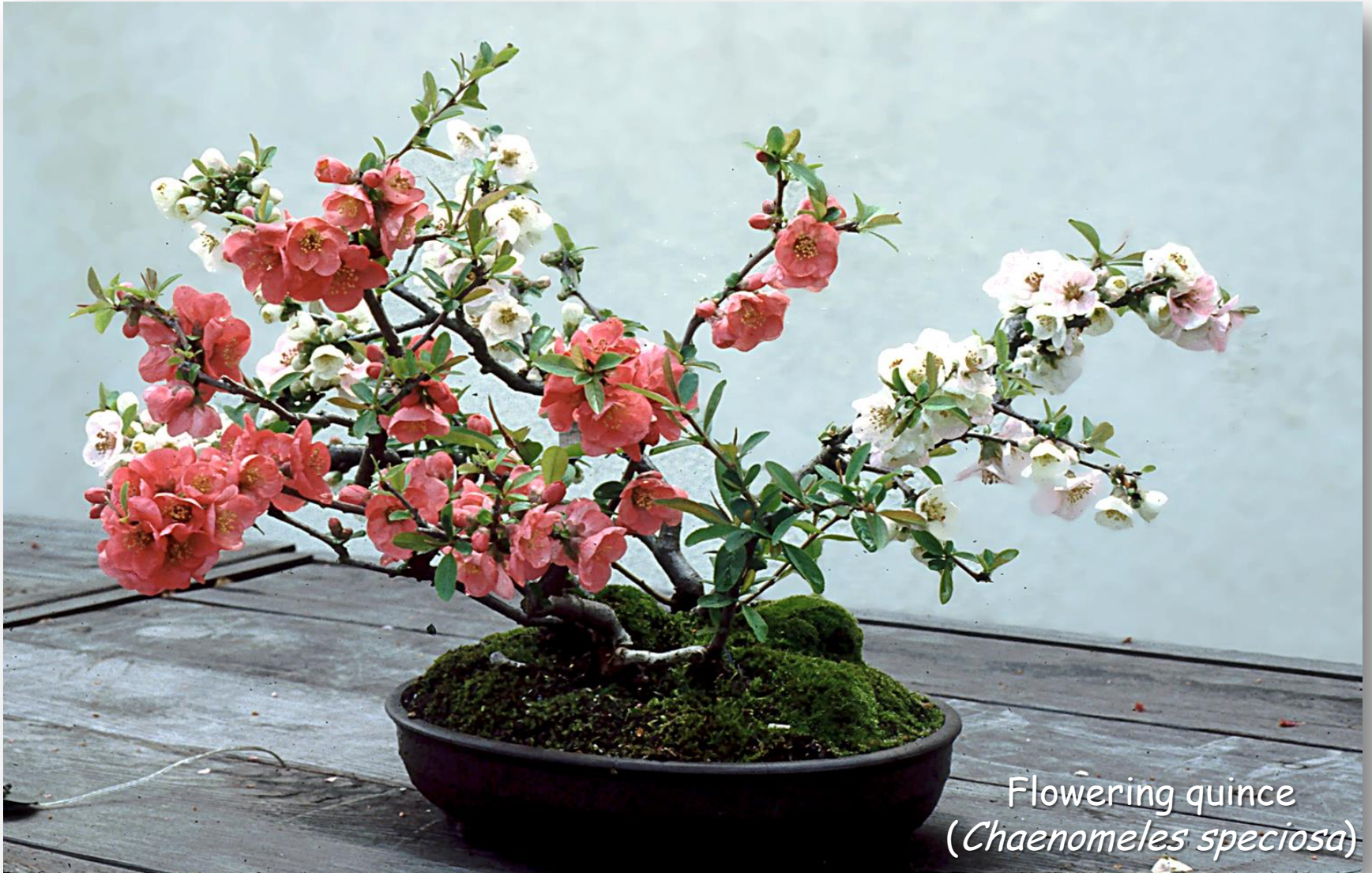
Flowering quince ( Chaenomeles speciosa )