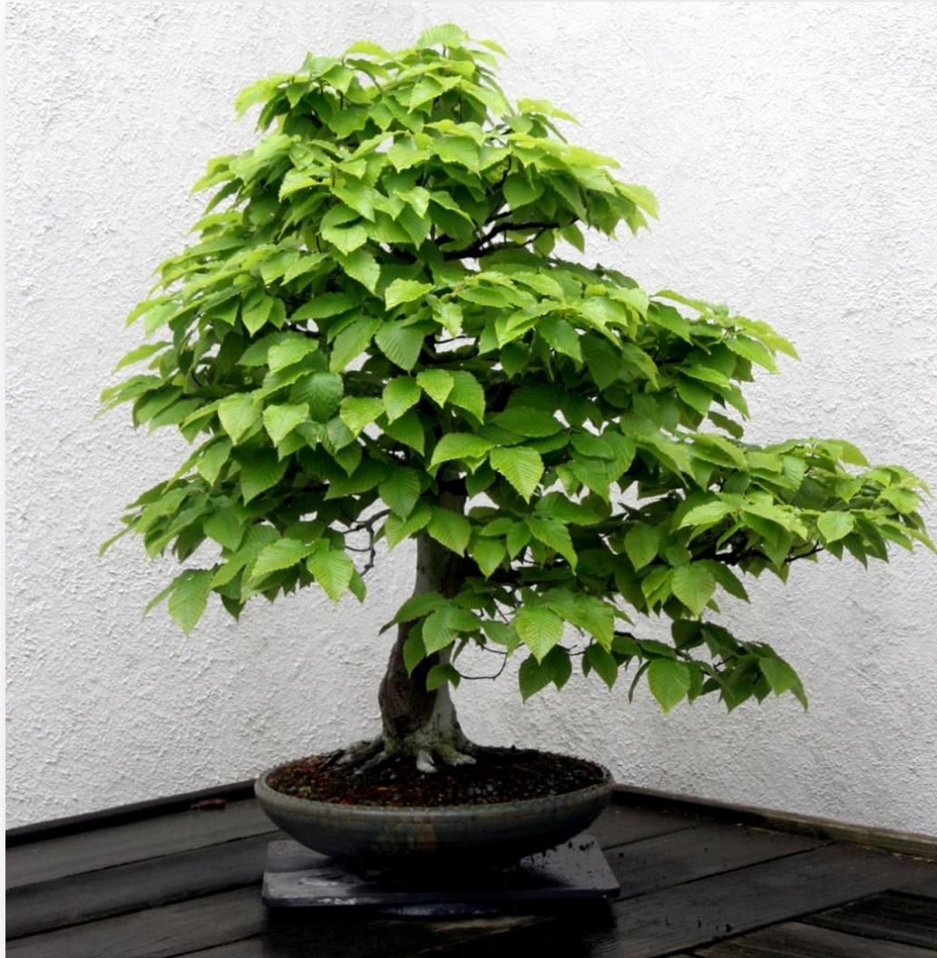
Japanese zelkova ( Zelkova serrata )