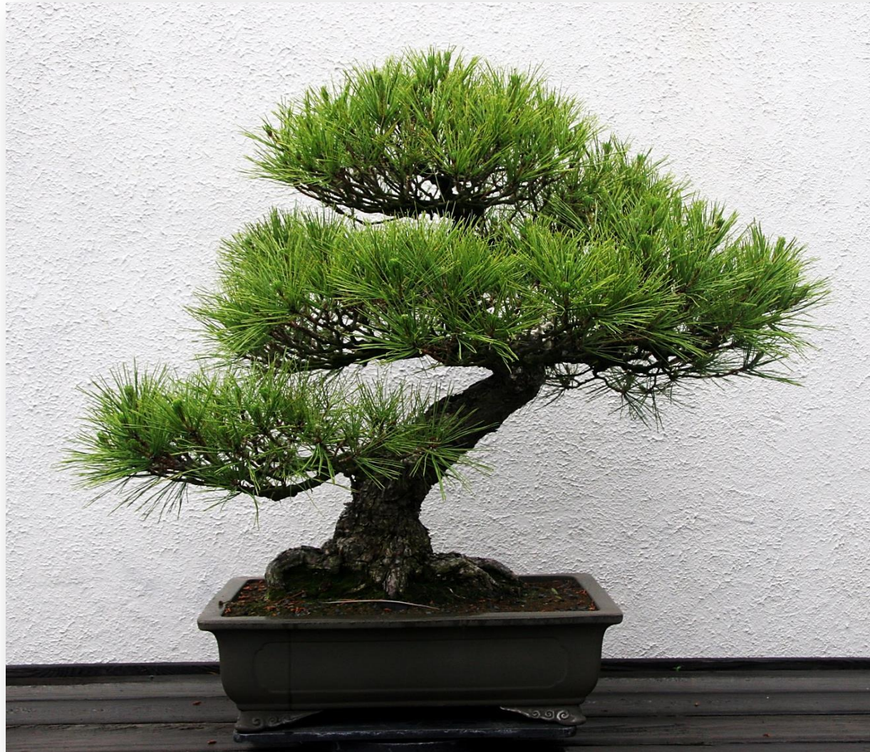
Black pine ( Pinus thunbergii )