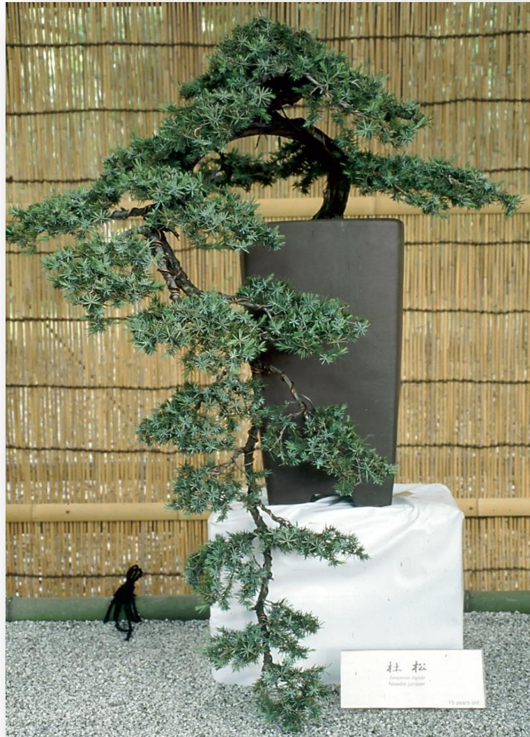
Japanese juniper ( Juniperus procumbens )