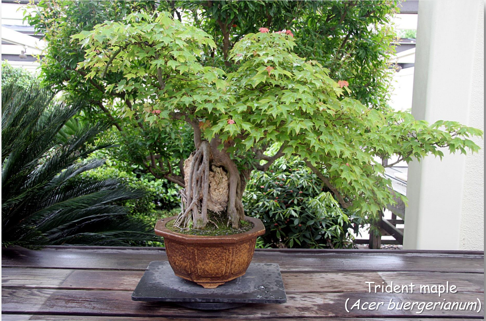
Trident maple ( Acer buergerianum )