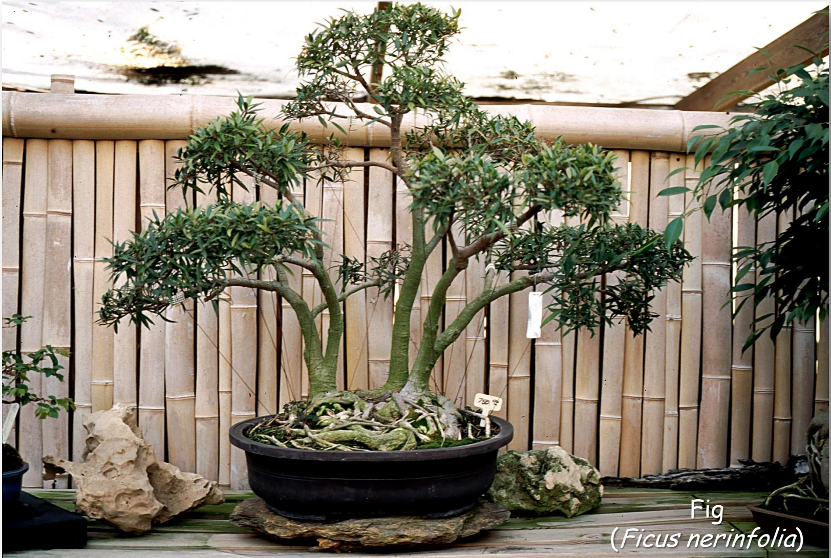
Fig ( Ficus nerinfolia )