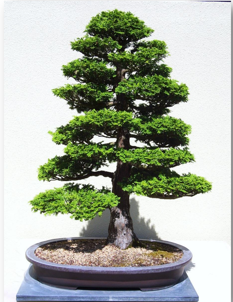
Juniper ( Juniperus chinensis )