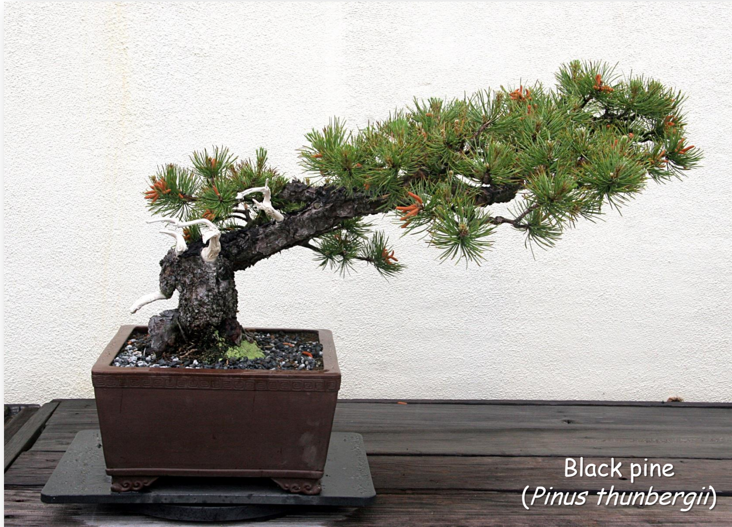
Black pine ( Pinus thunbergii )

Slanting style - Windswept (Fukinagashi)