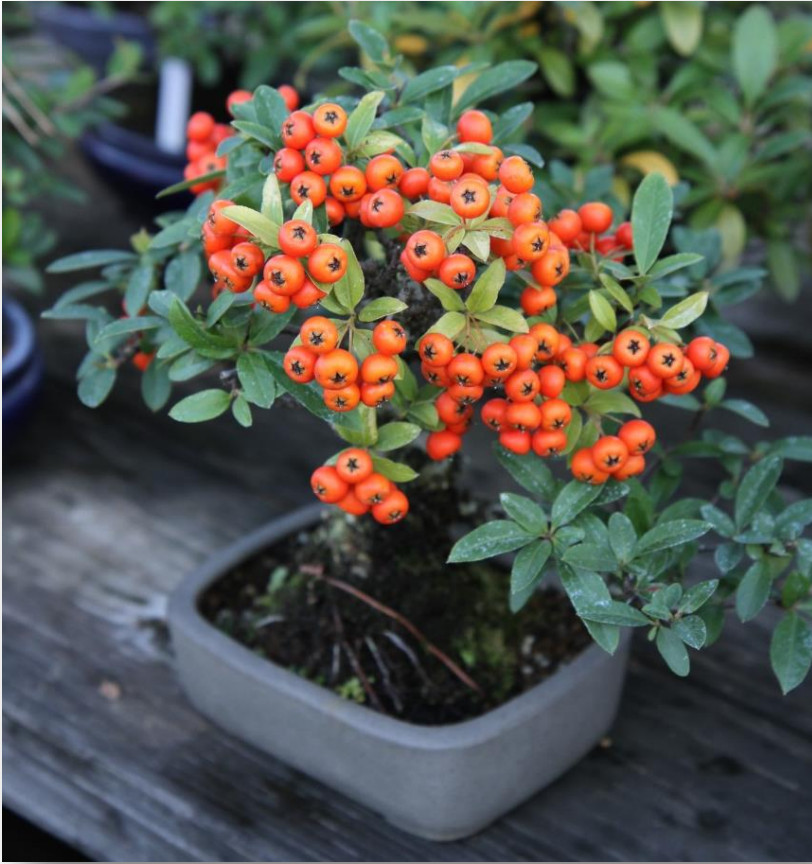
Firethorn ( Pyracantha )