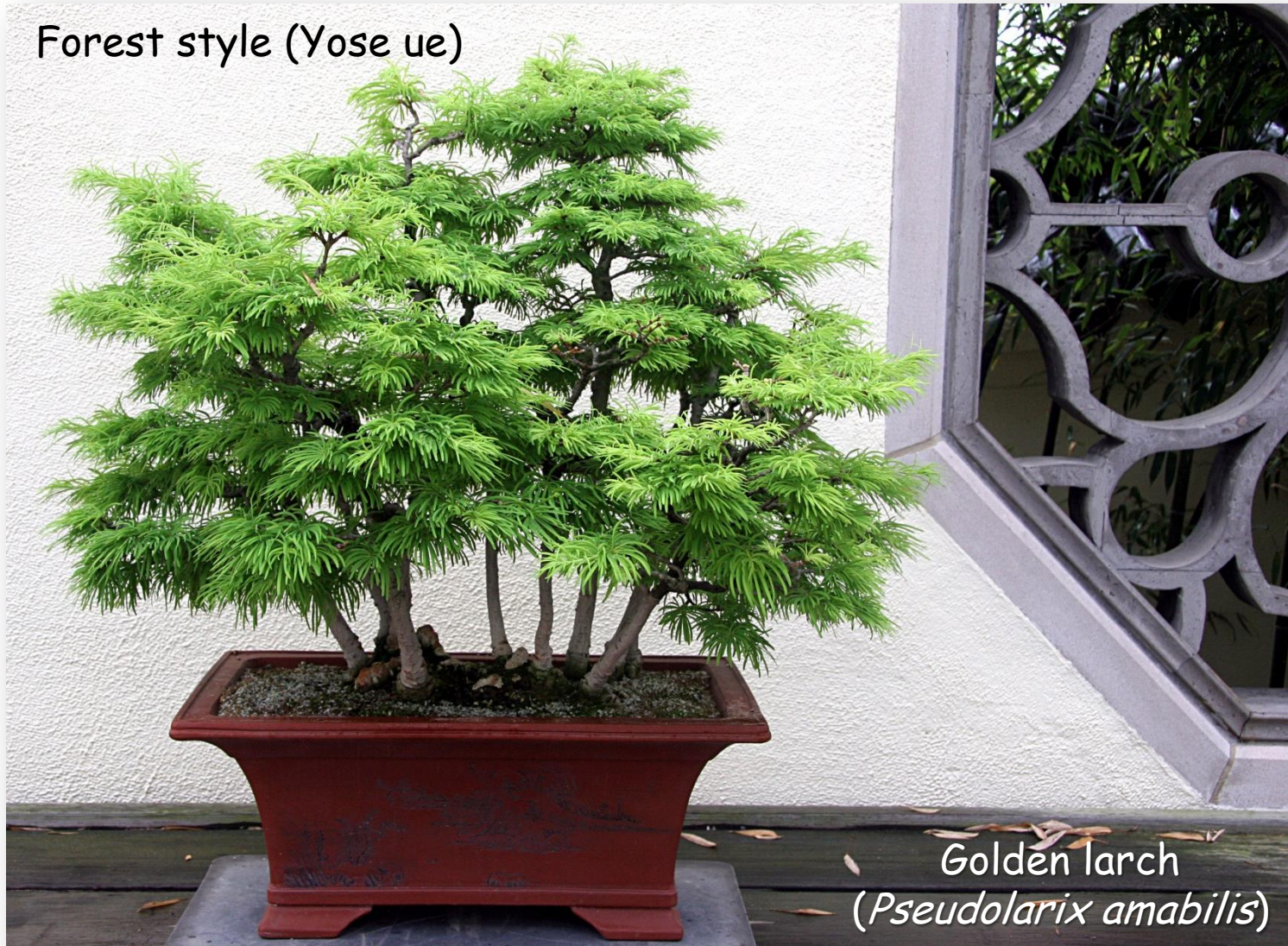
Golden larch ( Pseudolarix amabilis )