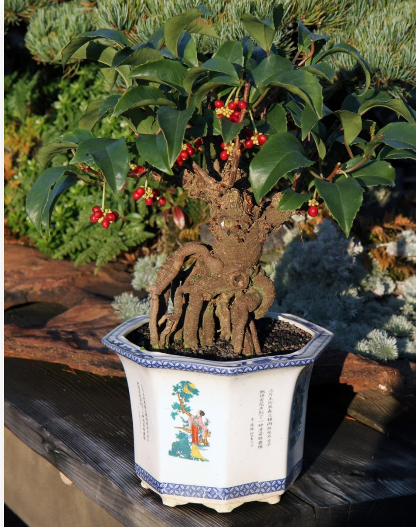
Kadsura ( Kadsura japonica )