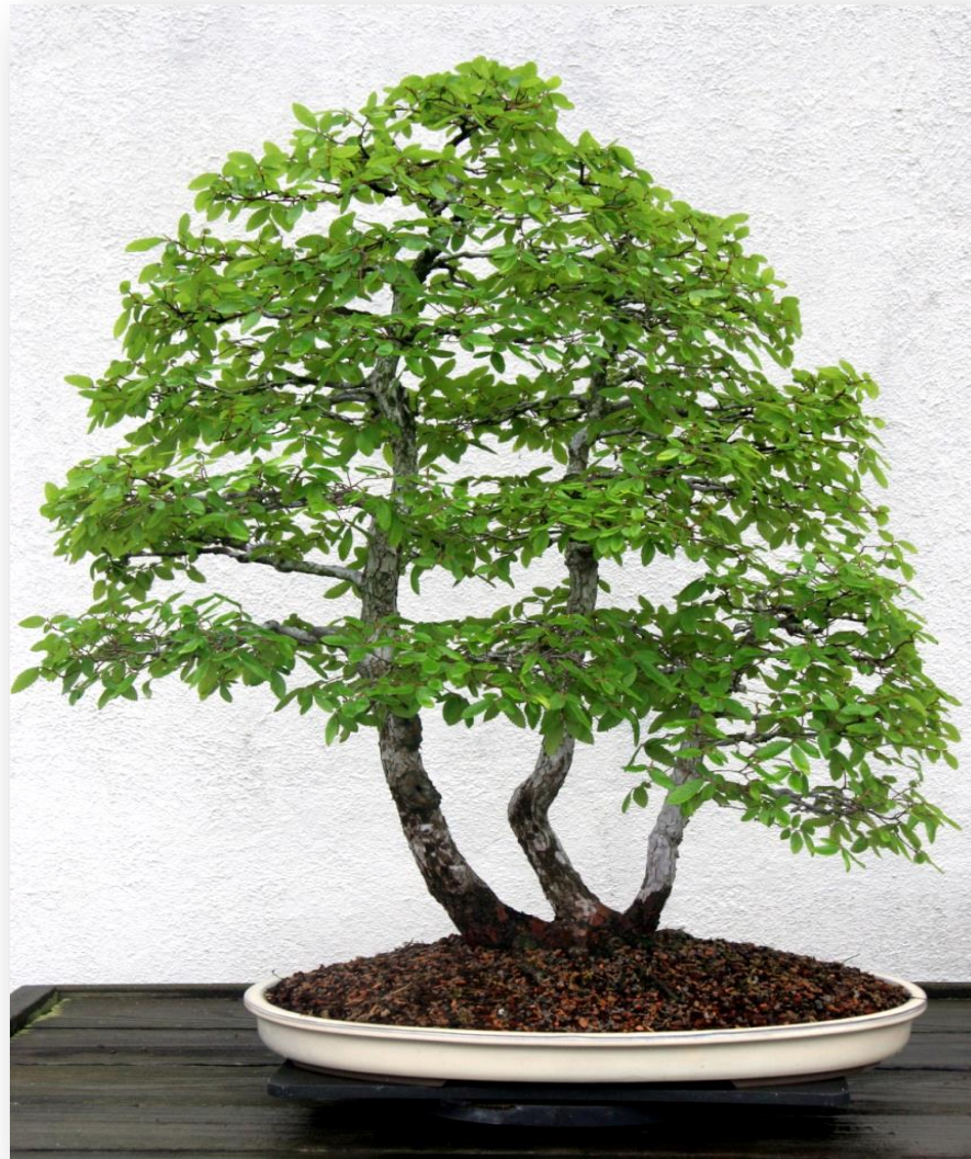
Chinese elm ( Ulmus parviflora )