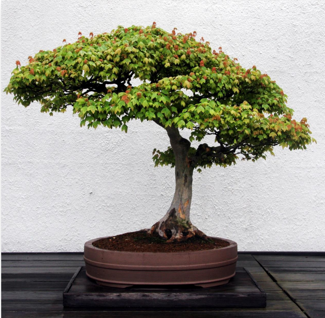
Trident maple ( Acer buergerianum )