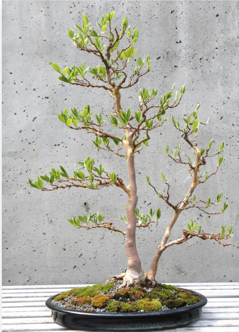
Japanese stewartia ( Stewartia pseudocamelia )