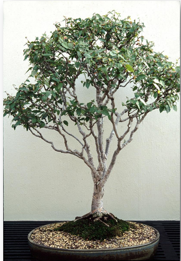
Japanese zelkova ( Zelkova serrata )