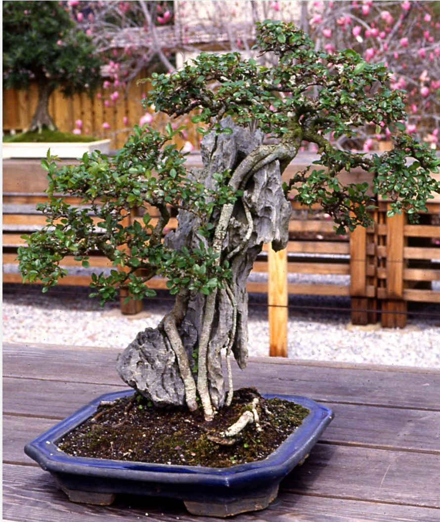
Chinese elm ( Ulmus parviflora )