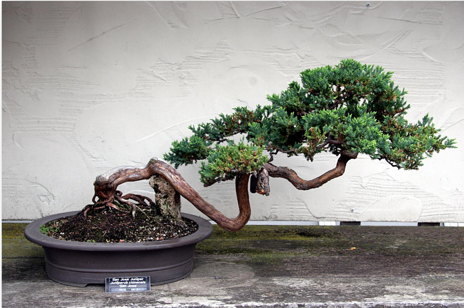
San Jose Juniper Juniperus chinensis 'San Jose' 2010