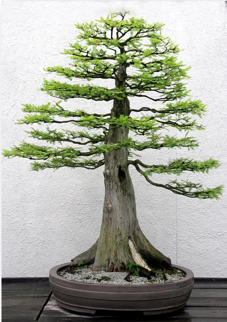
Bald cypress ( Taxodium distichum )