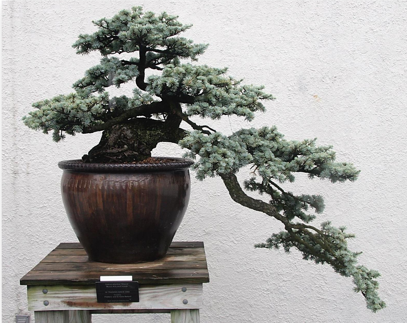
Blue Atlas cedar ( Cedrus atlantica )