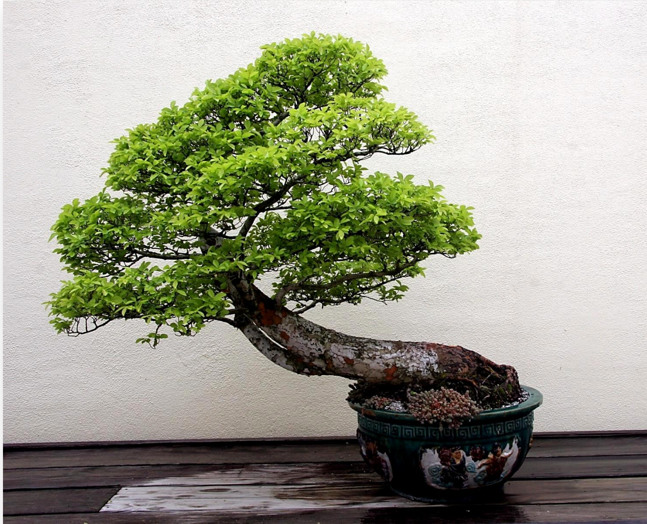
Eugenia ( Eugenia sp. )