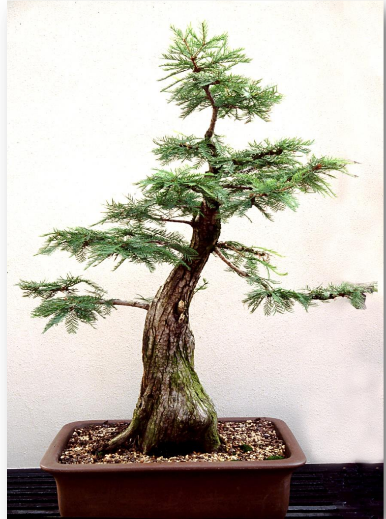
Bald cypress ( Taxodium distichum )